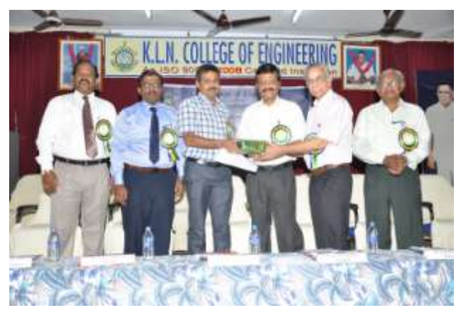
Momento presentation on clusiter'14

Our department has successfully conducted the National Level Technical symposium " CLUSITER'14 " on 11/09/2014.Vrious college actively participated on the day.This symposium was conducted to enhance the technical and non-technical skills of students.